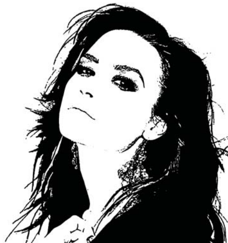
Result at step 7